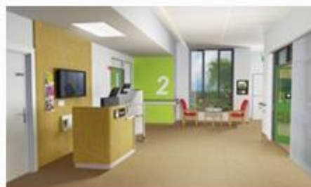
Corridor Scene 2