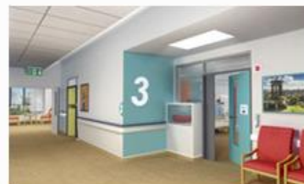
Corridor Scene 1