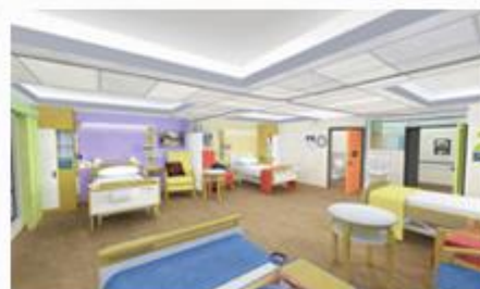
Four Bedded Ward - Overall