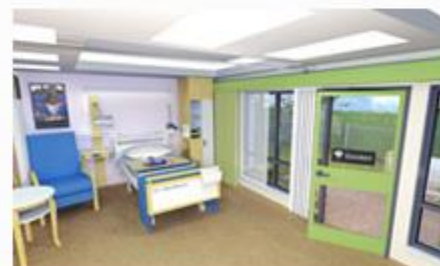
Four Bedded Ward - Close up